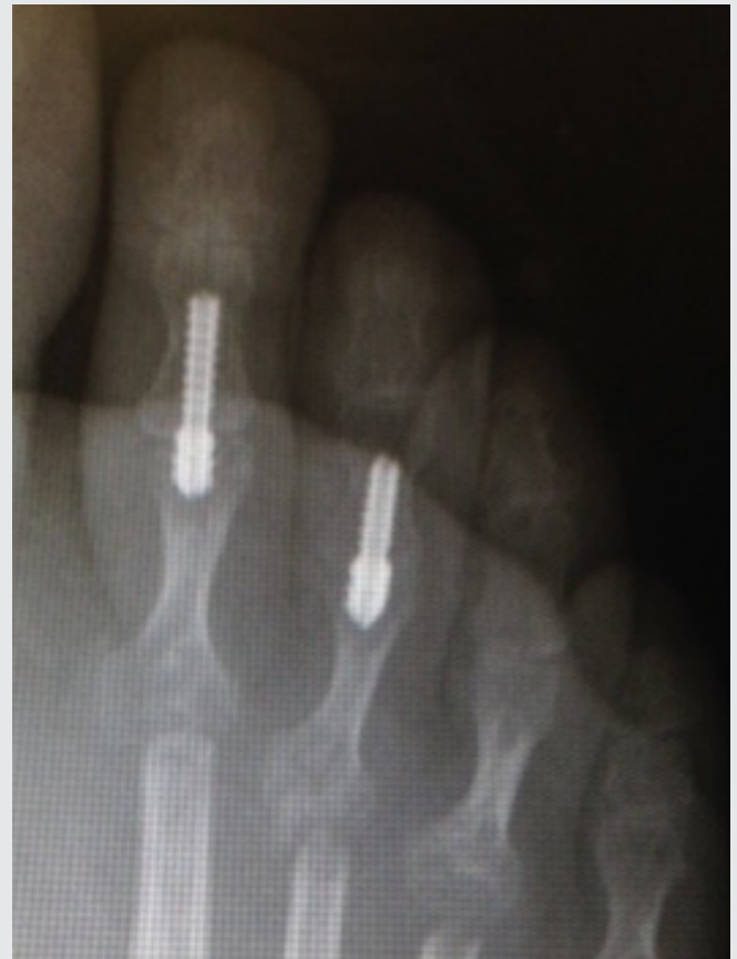
Figure 1. Anterior posterior radiograph showing completed digital fusion with the cannulated implant.

Additional tendinous or capsular releases of the metatarsophalangeal joint (MTPJ) or DIPJ are performed as indicated. The patient may be full weightbearing in a surgical shoe immediately postoperatively, with a half-inch piano-felt liner from heel to sulcus if a K-wire is crossing the MTPJ. The protective shoe is maintained for approximately six weeks.