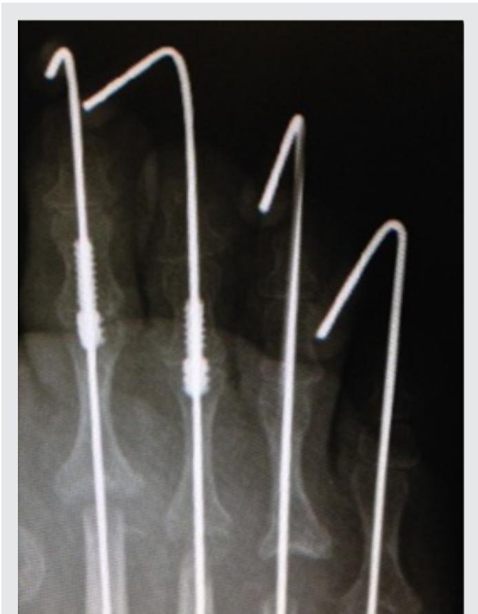
Figure 2. Anterior posterior radiograph of digital fusion and cannulated guide pin. The pin crosses and stabilizes the MTPJ.